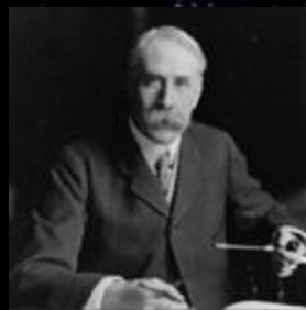
Edward Elgar English Composer 1857 - 1934