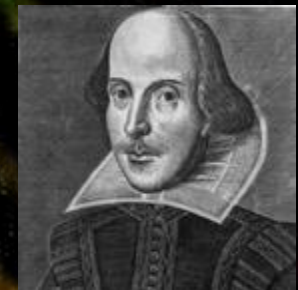
William Shakespeare English Playwright 1564 - 1616