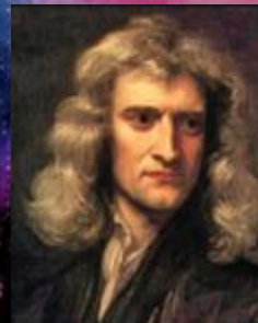
Isaac Newton Physicist and Mathematician 1643 - 1727