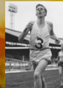
Roger Bannister British Athlete 1929 - 2018