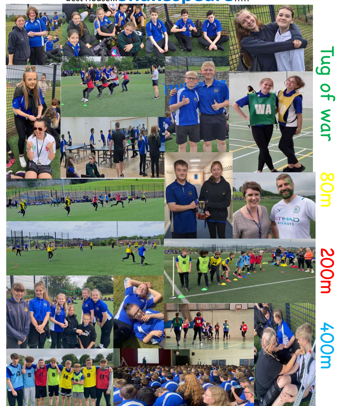
Table Tennis Football Shot Put