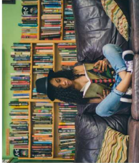
Booksmart: Scientists have shown that regular reading makes your brain work faster.

Reading helps you pay attention. "Reading is to the mind what exercise is