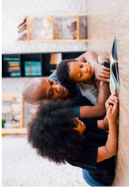
Lost for words: Reading for pleasure is a sign of success at school and in later life.

Although it is celebrated in March in the UK, the United Nations selected 23 April for the holiday because of the many authors whose birth or death occurred on this day. For example, Shakespeare, Haldor K Laxness, and Manuel Mejía Vallejo were born on 23