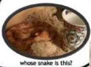
whose snake is this?

Can you match the pet to the correct teacher?