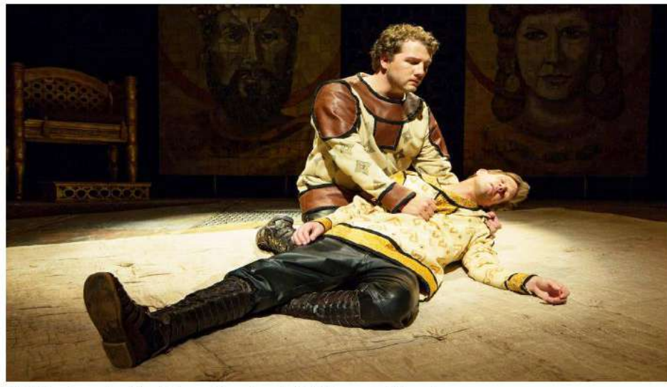
Flights of angels: Horatio's words capture both his love and despair.

Is old language still relevant? Poetry is used to capture people's emotions. The new king quoted a classic playwright during his first speeches as monarch.