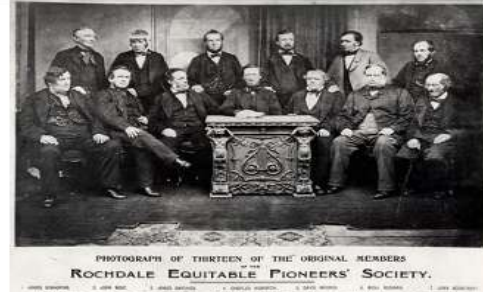
PHOTOGRAPH OF THIRTEEN OF THE ORIGINAL MEMBERS OF THE ROCHDALE EQUITABLE PIONEERS' SOCIETY.

The British Co-operative Society- now a worldwide model (Other retailers are available!)